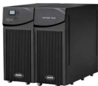
External Battery (Optional)